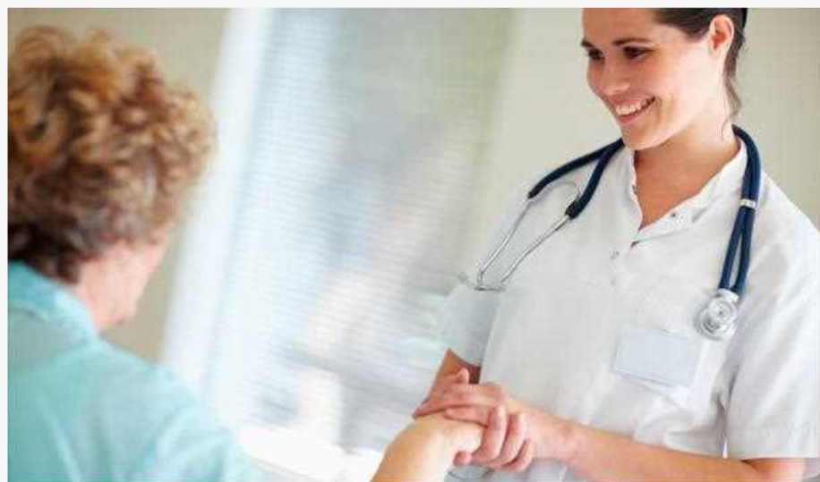
HemorrhoidsExternal HemorrhoidsHemorrhoidShrink HemorrhoidsInternal

“ External Hemorrhoids: These are located outside the anal opening as well as they are usually easy to diagnose since they are usually painful from the early stages. Due to improper eating habits, the stool gets hard and injures the soft and delicate inner mucosal lining of the anus and also the anus responsible for absorption of essential nutrients. This causes anal fissures which aggravate the hemorrhoids. Due to high blood pressure there could be moderate to severe itching, irritation and pain. High blood pressure can also result in the blood loss from the hemorrhoids leading to an embarrassing situation. (Click here to be able to understand how to effectively deal with the pain of hemorrhoids)