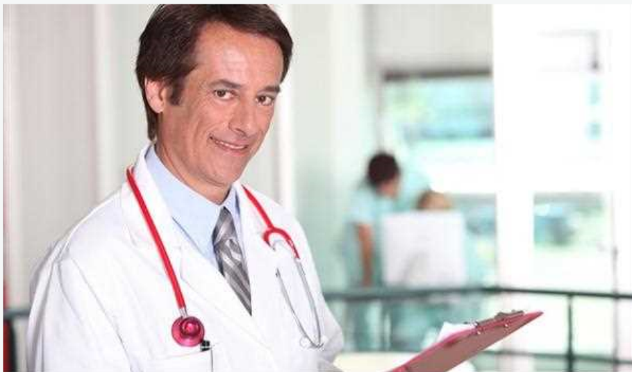
HemorrhoidsHemorrhoidExternal HemorrhoidsExternal HemorrhoidThrombosed

May be challenging initially, as there are a variety of ways to approach them, both natural and conventional. Finding the best treatment for hemorrhoids is accomplished by the patients educating themselves on the various options, and making a decision about what works for them.