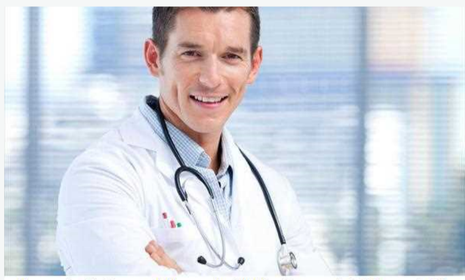
Hemorrhoids External Hemorrhoids Piles Hemorrhoid Hemorrhoids