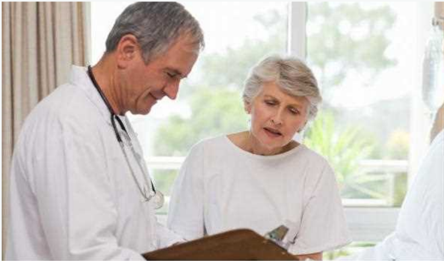
HemorrhoidsHemorrhoidHemorrhoid TreatmentInternal HemorrhoidsHemroidsPiles