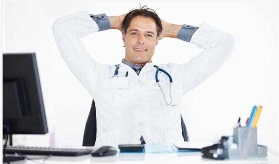
HemorrhoidsHemorrhoid ReliefHemorrhoids SevereHemorrhoidHemorrhoidal