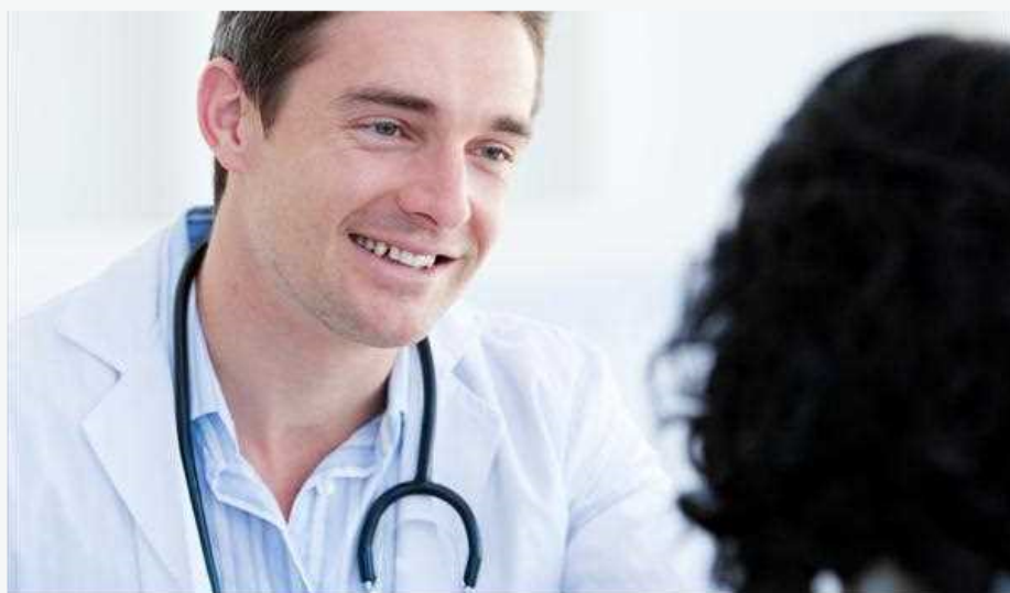
HemorrhoidsExternal HemorrhoidsInternal HemorrhoidsHemorrhoid

You will be happy to know that there are remedies for hemorrhoids that you'll be able to take advantage of if you choose to eliminate all of them soon. You can find home cures that you can actually utilize should you have a really negligible case with this condition. You have to concentrate in order to correctly destroy your complaint immediately. You have stayed mum concerning this for a long time which is the best time for you to have the help you should prevent further health problems to surface because of this.