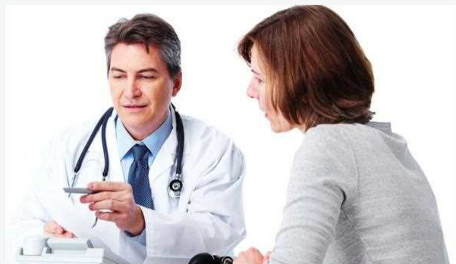
Doctor for Hemoridal

You can treat hemorrhoids at home by sitting in warm water 3 times per day for about 15 to 20 minutes. This helps reduce the redness of a hemorrhoid. Completely dry off your arschfick area after the warm bath tub to avoid irritating the skin that surrounds the rectum. Changing your diet can also increase the healing of a hemorrhoid. Consuming more fiber-rich foods and increasing your fluid intake prevents constipation and lessens pressure your anus and rectum, reducing the bleeding, discomfort and inflammation caused by a hemorrhoid.