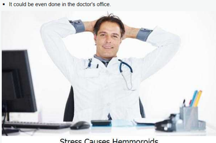
Stress Causes Hemorrhoids

So in the event that you are now tired of trying out all possible cures and solution to your hemorrhoidal concern, short of going for a surgery to remove them I suggest that you read on and find out ways to get rid of your pesky hemorrhoids permanently.